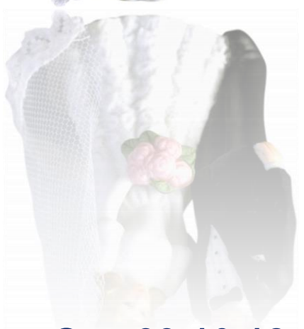
Gen 22:16-18 Num. 30:1-2